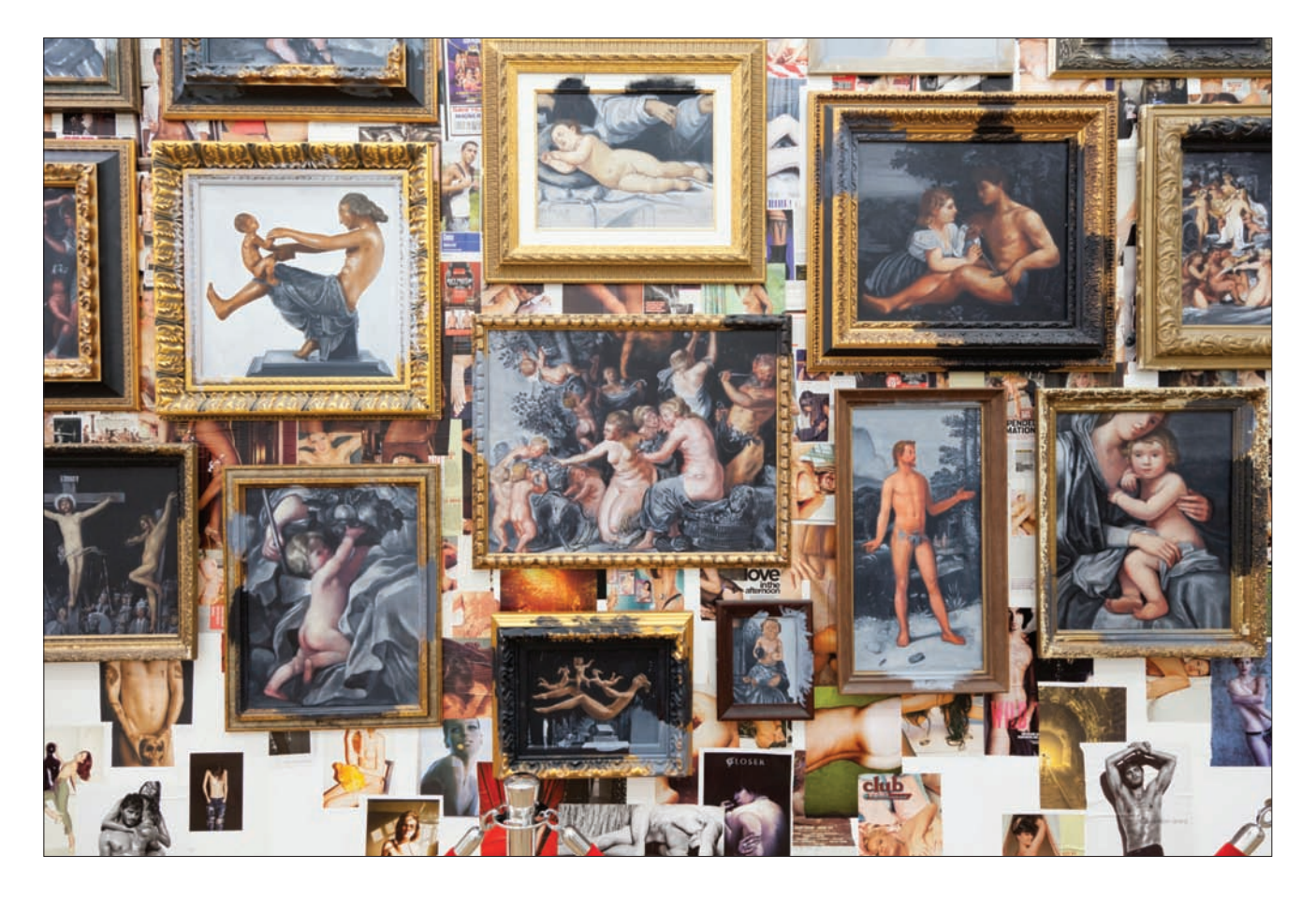
ABOVE Ellen Harvey, The Nudist Museum (detail), 2010, an idiosyncratic overview of the nude in Western art.