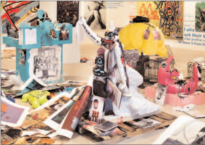
Bjarne Melgaard, The Synthetic Slut , 2010, mixed media, installation view. Greene Naftali.